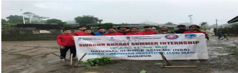
Tree Plantation in spite of heavy rain.

One of the best ways to beat air pollution is to plant more Trees. Heavy rain did not stop us from this plantation and we have planted 150 flower Tree Saplings along the road to Rabunamai Village which will not only purify air but also beautify the Village, as well as gives shade to the people who travel along this road.