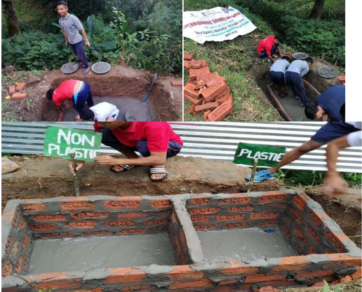
Door to Door Campaign on Solid Waste Material