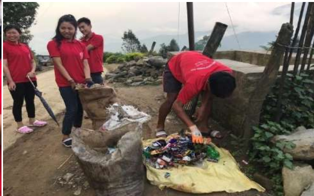
Segregating the solid waste material from dustbins. Before and After.