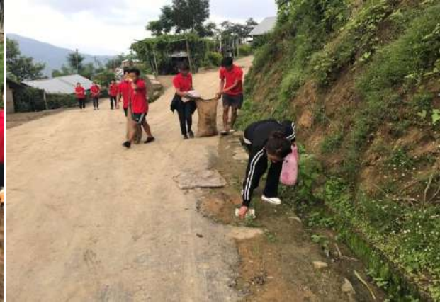
Cleaning Drive Before and After.