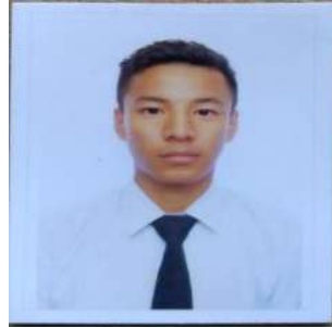
7) Cuppet B.Sc. 5 th Semester