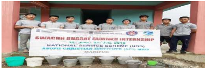
After Cleaning the Toilets and repairing pathways respectively.