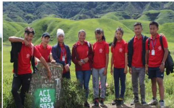
GROUP PHOTO AFTER THE CLEANING DRIVE