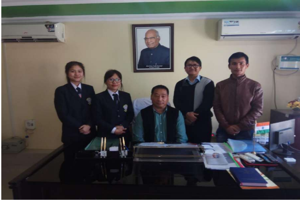
With Shri L. Dikho, Minister of Public Health Engineering Department, Printing and Printing and Stationary, Govt. of Manipur