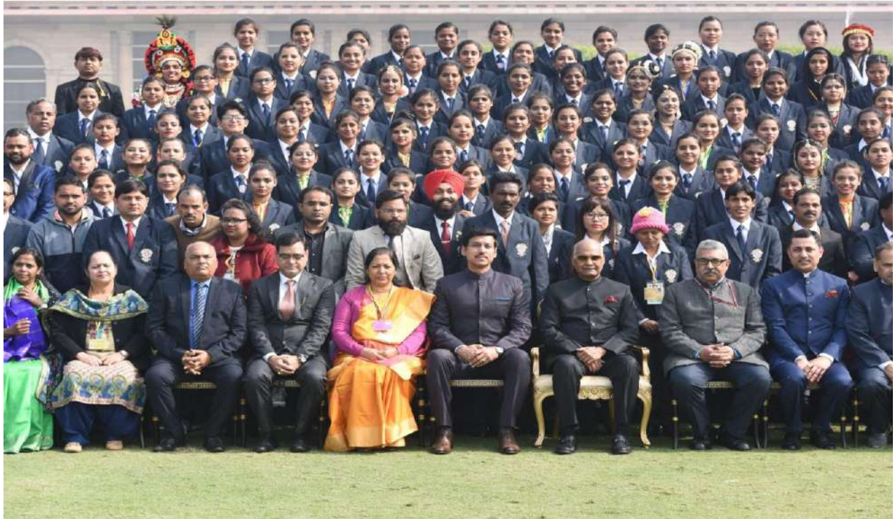
With Hon'ble President of India Ram Nath Kovind