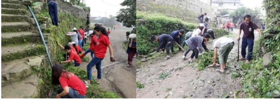
Extensive Cleaning Drive.