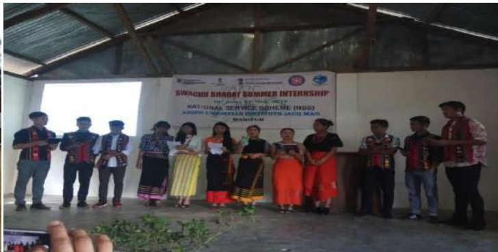
Village Youth Performing Cultural Dance on SBSI Cultural Programme. SBSI Team Presenting Folk Song.