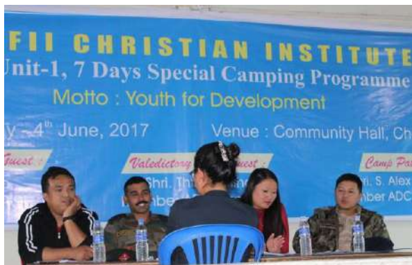
Mock Interview: Panels

At the end of the day the volunteers have Cultural night where the Adopted Villagers participate in various cultural activities like folk song, narration of folk tale etc.