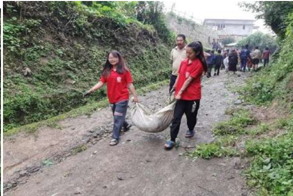
Mass Social Work and Installation of Dustbins.