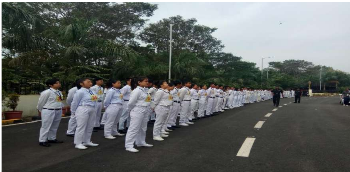
NSS Volunteers line up the for Final Selection.