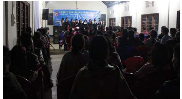
Cultural Night: Village