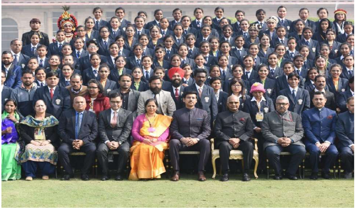
With Shri Ram Nath Kovind, President of India.