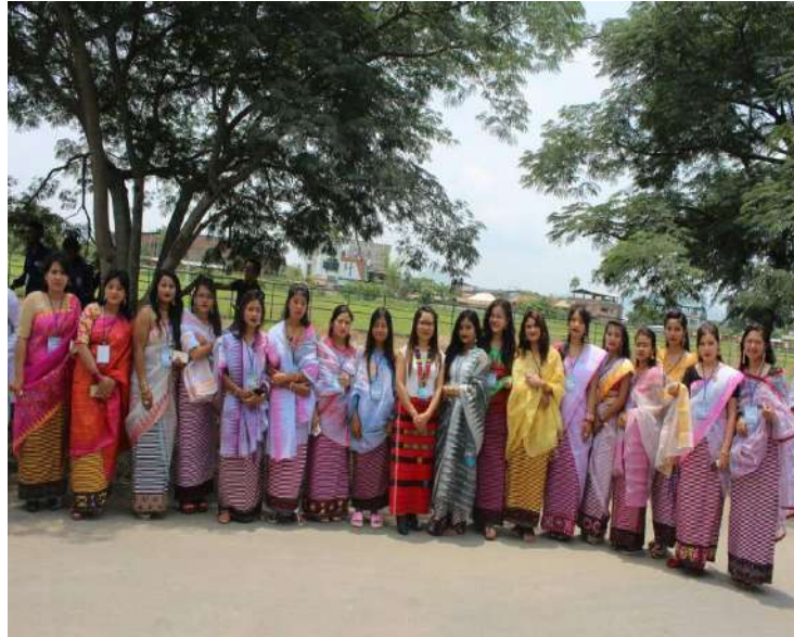
North East Participated.