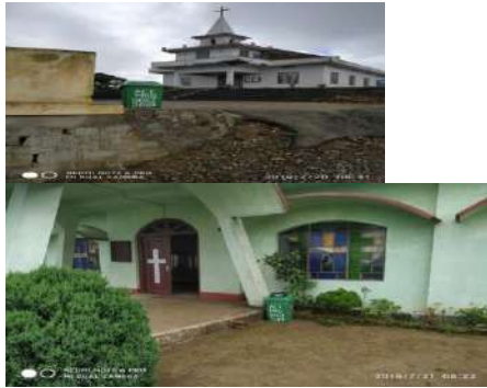
Installation of Dustbins in the Church Compound