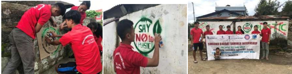
Say no To Plastics!