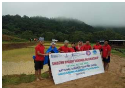
Helping in the Paddy Plantation; The Team got blessing from Grandmother.