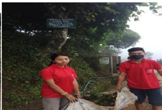
i) Cleaning drainage before and after.