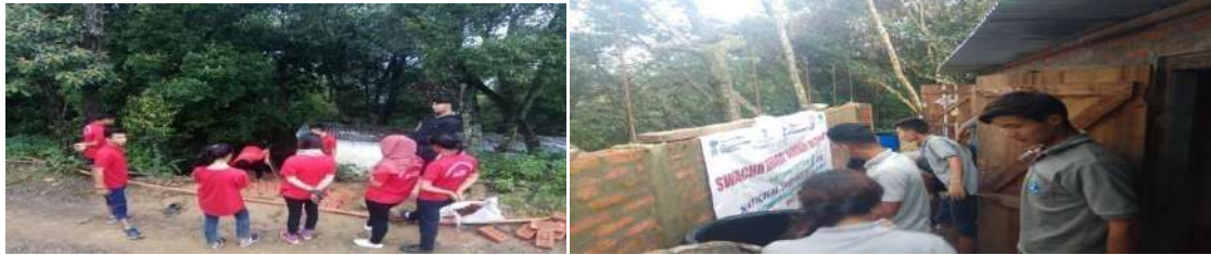
Cleaning the Toilets and repairing pathways.

The Team conducted cleaning drive in the College Campus, the Drainage, cleaning toilet, cleaning the dustbins and rally as well.