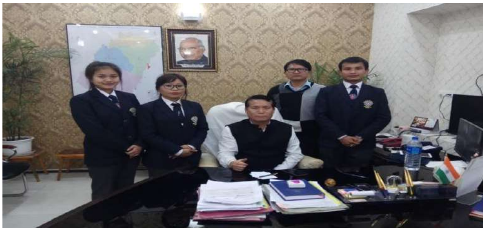
With Shri Letpao Haokip, Youth Affairs and Sports Minister, Govt. of Manipur