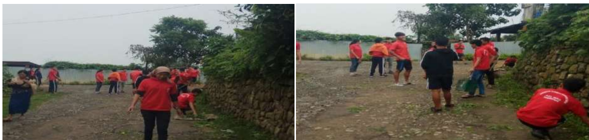
Cleaning the Drainage and the Roadside.

One day cleaning drive was carried out at Punanamei Village, which is more than a KM away from college. We cleaned up the drainage and the surroundings.