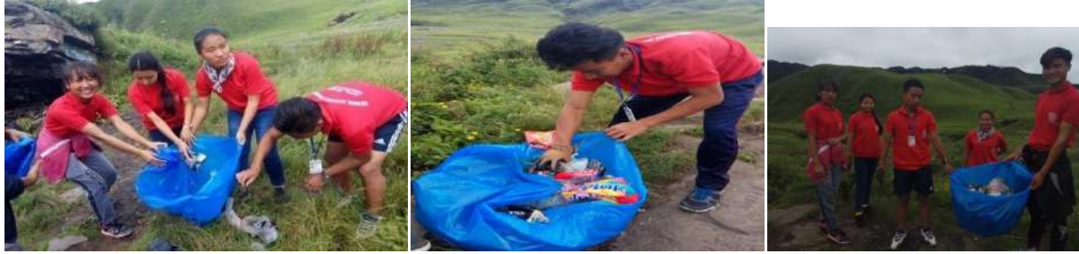
Plastics and sweets covers left by the visitors.