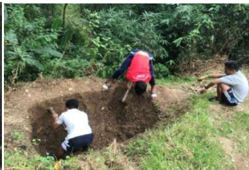
ii) Public Compost Pit, Plastics and non Plastics

ii) Public Compost Pit, Plastics and non-Plastics: We have dug a compost pit which little away from Village to dump the solid waste material particularly of plastics and non plastics separately.