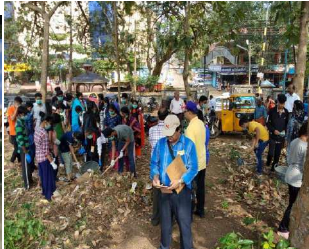
Cleaning Drive during the Camp

The Camp tries to bring about the integrity of the Country through this Young people. Making them mingle with different cultures and appreciate their culture. There was one day sightseeing trip to Kanyakumari and it was wonderful to see such a beautiful place. They had known each other just for a few days yet the bond developed between them seemed so strong despite the diversities. I can confidently say that "Oneness through NSS" sees no caste, tribe, religion and no gender. And so, the need of the hour is to provide more opportunities to students to explore, to embrace and to accommodate each other's differences with is possible through NSS.