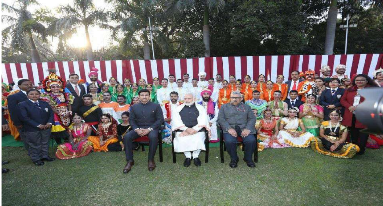
NSS Cultural Troop with Hon'ble Narendra Modiji, the Prime Minister of India.