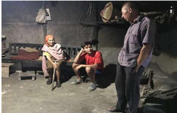
Visiting Old Age Home and Helping Old Age Grandmother.

The Team not only carried out in the cleaning drives at various villages but also visited old aged home in Rabunamai village. We also helped in the last paddy plantation in one of the grandmother’s paddy field.