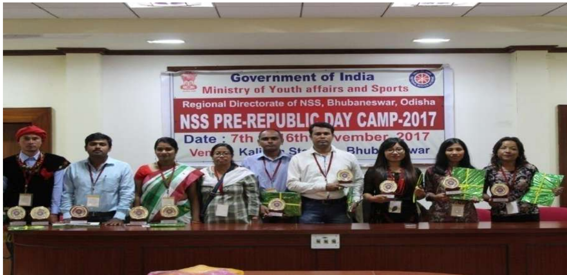
With the Contingent Team Leader of the Camp