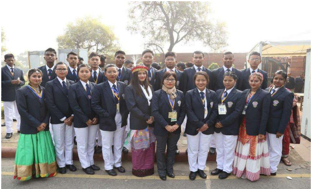
With Guwahati NSS Contingent