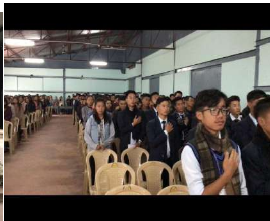
Asufii Christian Institute, Taking Pledge on 'Plastic Free Zone Campus' during SBSI-2019