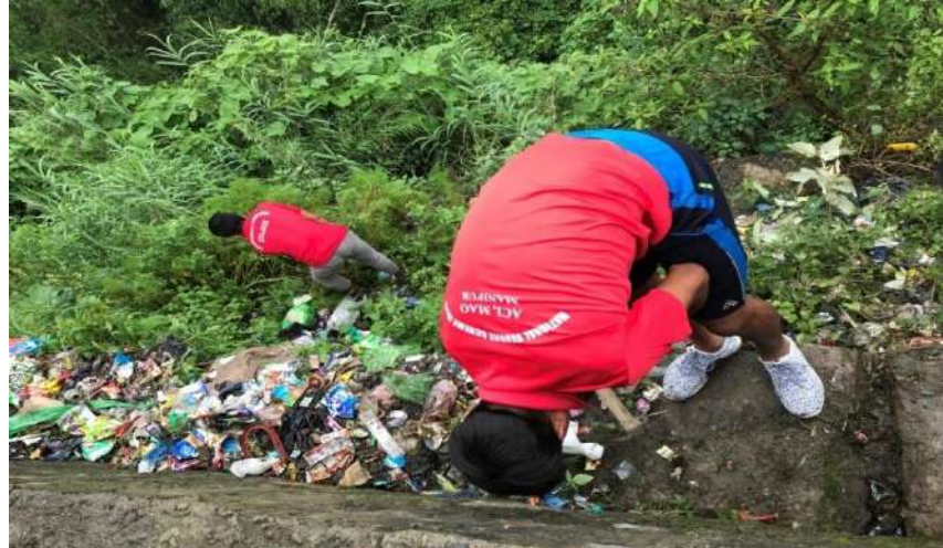
Segregation of Solid Waste. Before and After After the Clean Up