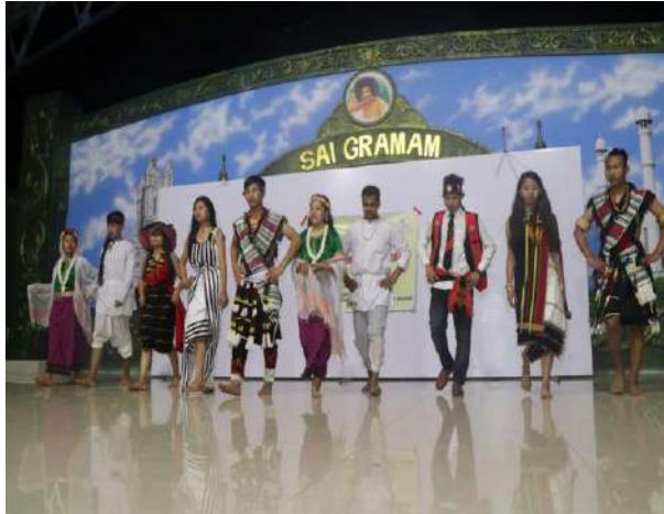
Cleaning Drive conducted during the NIC Camp.