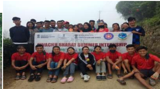
After cleaning one of the dirtiest drainage in the area.