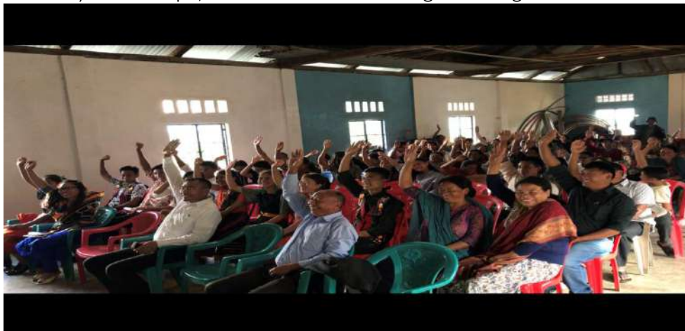
The Villagers Taking Pledge by Raising the right hand not to litter and keep Village a 'Plastic Free Village' .