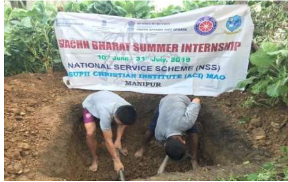
Digging of Household Compost pit to convert to manure.