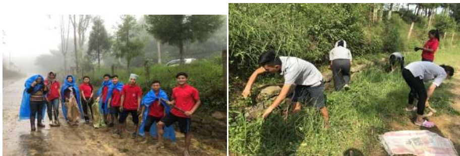
Cleaning the Drainage