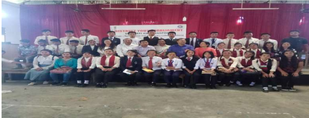
With the Youth Parliament Participants